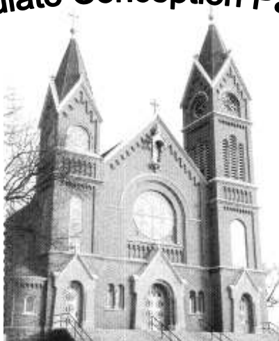
650 Main St. PO Box 131 New Munich MN 56356-0131