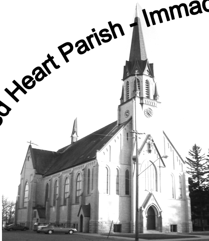
106 3rd Ave N E, PO Box 155 Freeport MN 56331-0155