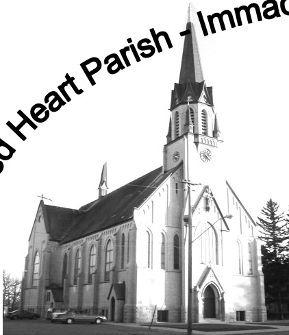
106 3rd Ave N E, PO Box 155 Freeport MN 56331-0155