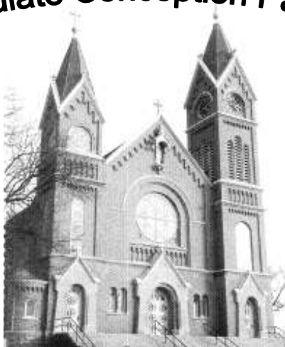
650 Main St. PO Box 131 New Munich MN 56356-0131